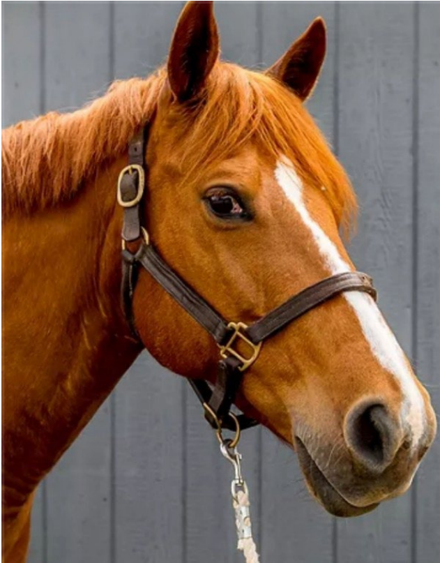
Taffy's Misty Breeze

Cloverleaf Equine Center is a 501(c)(3) nonprofit organization that helps individuals realize their highest potential by providing equine-assisted services to people with disabilities, youth from marginalized communities, recovering military personnel, and others in need.