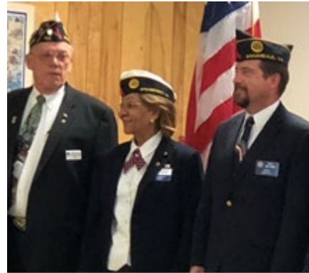
District 17 Installation Ceremony

for the support from the entire Post 1976 Legion family.